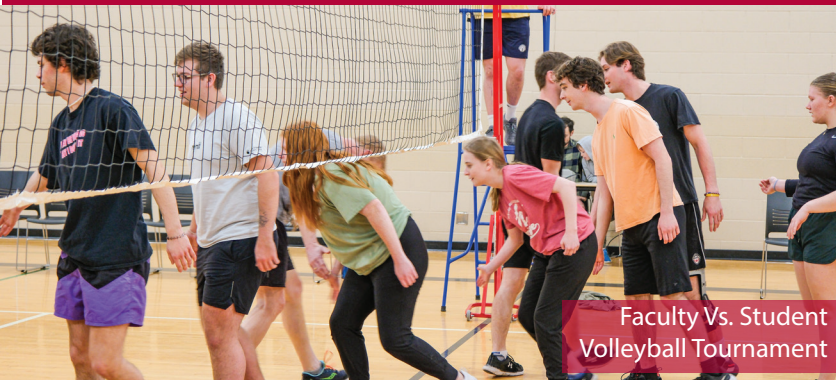
Faculty Vs. Student Volleyball Tournament