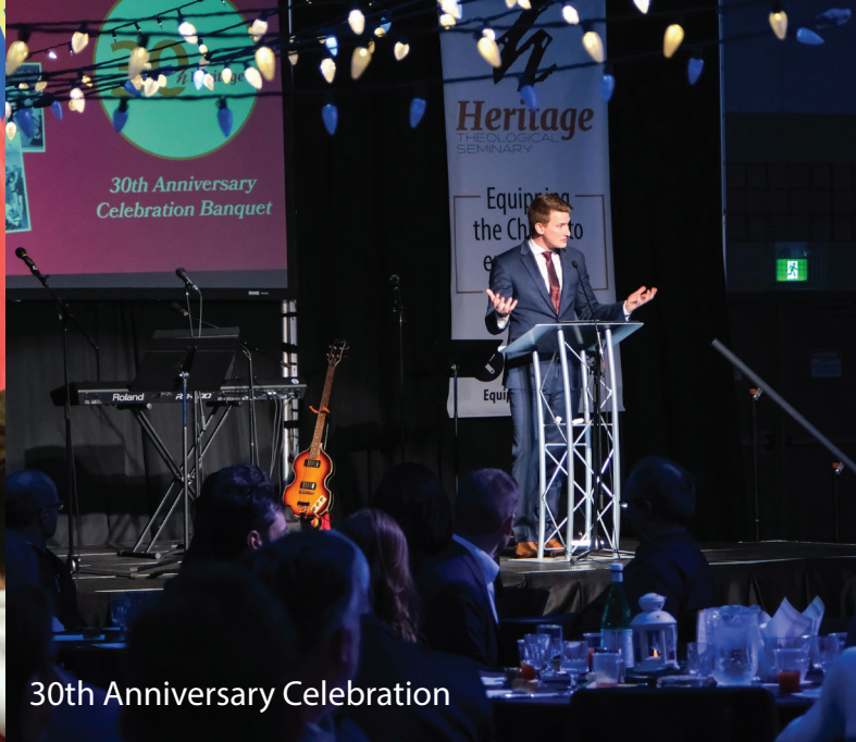
30th Anniversary Celebration